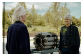
Inside James Dyson's Reinvention Factory