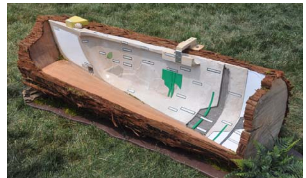
Cross section showing construction phases