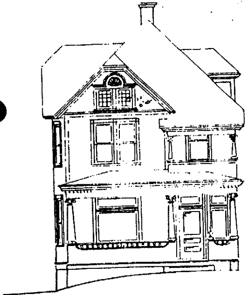
Plan and elevation of Cambria Steel Company House, 146 Colgate Ave., Westmont. Drawing by Cambria Steel Company, 1911. Collection: Johnstown Flood Museum.