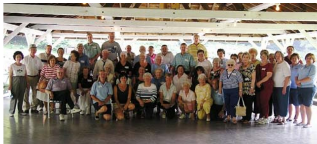
Alumni Group Picture, August 2009

As a reminder, the Alumni Association operates on a Fiscal Year, July to June. Memberships are now being accepted for 09-10. Please use the above application for membership renewal. If you have any questions, feel free to contact the Alumni Association at 533-5601 x 1001 or e-mail alumni@gjsd.net