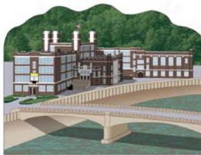
Front Side (Dimensions 5" H x 6 1/2 W)

Checks payable to: Gr. Johnstown High School Alumni Association 222 Central Avenue, Johnstown, PA 15902