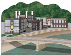
Front Side (Dimensions 5" H x 6 1/2 W)

Checks payable to: Gr. Johnstown High School Alumni Association 222 Central Avenue, Johnstown, PA 15902