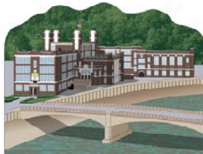
Front Side (Dimensions 5" H x 6 1/2" W)

Checks payable to: Gr. Johnstown High School Alumni Association 222 Central Avenue, Johnstown, PA 15902