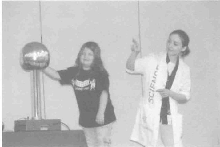
Carnegie's Traveling Science center visited students at East Side Elementary for a demonstration teaching students about electricity.

Parents Can Read Too: More than 250 East Side parents and family members have participated in the popular Raising Readers Workshops in grades K-4 through 5. Each workshop addresses a specific skill or component of the daily reading instruction. Parents then experience the modeling of the lesson with their child in the classroom setting.