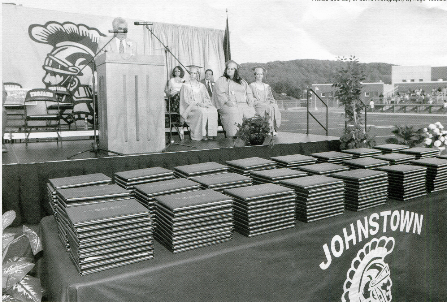
One era ended and another began at commencement ceremonies at Trojan Stadium on June 7.