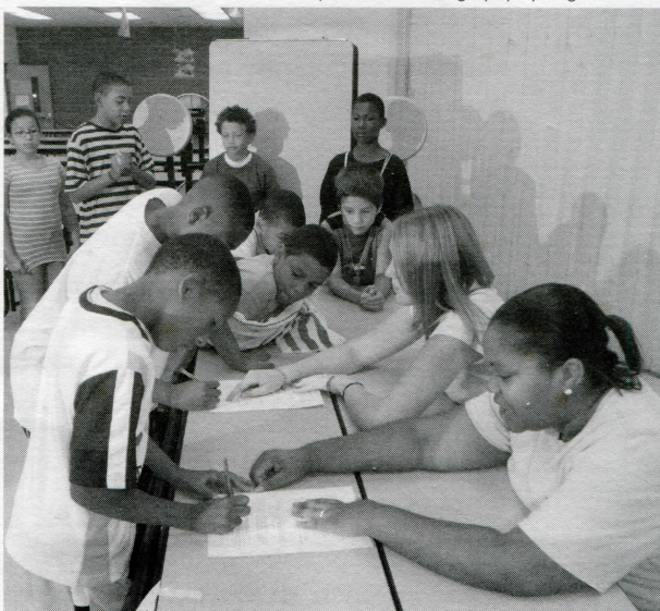
Students register for "Summer in the City" at East Side Elementary School.