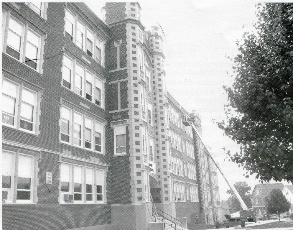
Johnstown Middle School was recently refurbished on the outside to enhance the longevity of the school as well as restore it to its original structural integrity.

Extreme Home Makeover: In an effort to preserve a true historical landmark, the Greater Johnstown School Board allocated resources to restore the middle school to its original structural integrity. JMS, formerly known as Garfield Junior High, is a part of the city's history. Efforts are underway to recreate cast pieces of concrete to match the building's original design. The entire front and two sides of the building have been refurbished, and failing mortar was cut out and replaced to create a weather-tight envelope that will enhance the longevity of the school.