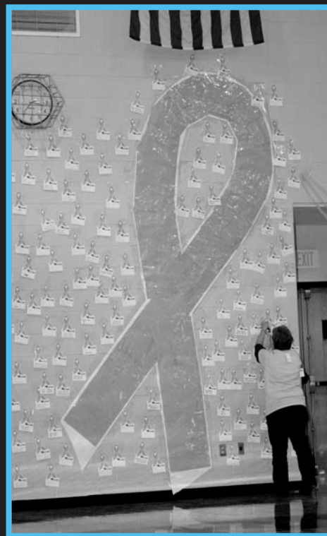
A Trojan Supporter Pins a pink ribbon on the Wall of Hope during the Lady Trojan's Shoot for a Cure fundraiser.