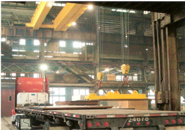
(A newly installed crane unloads sheet metal at the Cambria Iron Works Machine Shop)