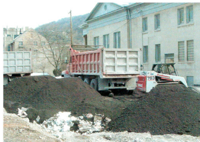
(Earthmovers Unlimited, Inc. workers backfill the razed site of the former Conemaugh Engraving Co., at the Regional Technology Park)

Along with Northrop Grumman, other tenants include the John P. Murtha Neuroscience and Pain Institute and the InforMedx Group.