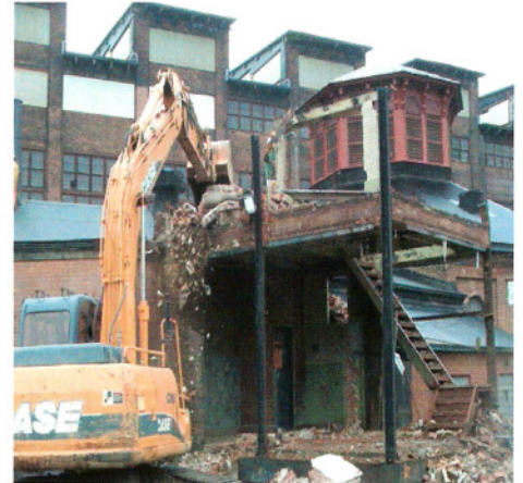
(Restoration of the Blacksmith Shop in the Cambria Iron Works is currently underway.)

J.C. Orr & Son will undertake remediation of the building, as well as restoration including new roof, windows, doors, and building support system in order to reutilize the facility.