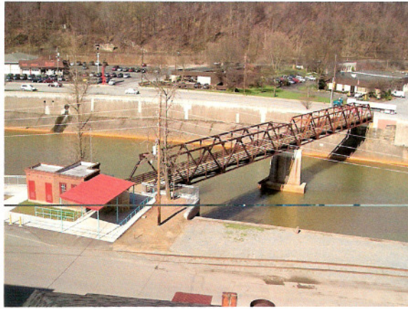
(An aerial view of the newly renovated Pedestrian Bridge)

Permanent lighting fixtures have been set in place and the former guardhouse at the entrance to the Lower Works has been renovated