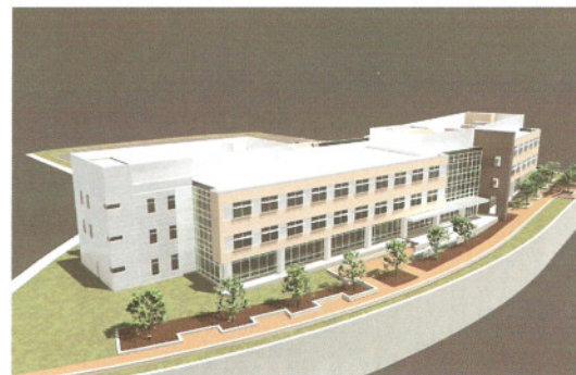
(Artistic rendering of the Regional Tech Park)

Northrop Grumman Corp., a nationally known defense and aerospace contractor, announced