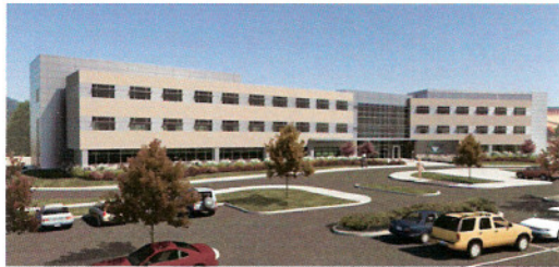
Above, ground level rendering of Greater Johnstown Technology Complex Building and construction photo, shown below.

which relays information between doctors in Johnstown and doctors on the battlefield. The secure software program allows for instant access to medical records of wounded military personnel and keeps track of veteran's records long after they are discharge from the service. This advanced data will aid in providing superior medical service needed for the men and women fighting for our Country.