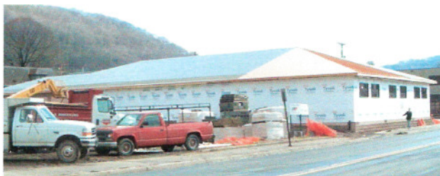
Above: Cambria Business Machines' new office