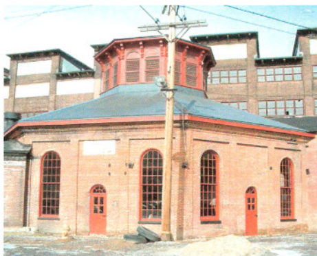
Above: Newly renovated core of Blacksmith Shop in Cambria Iron Works Right: Turn-of-the-century equipment

remediate and restore the Blacksmith Shop through funding secured from over 20 different Federal, State, and local sources. The Authority has also coordinated the construction process at the facility in order to provide a setting for modern day blacksmiths to use the turn-