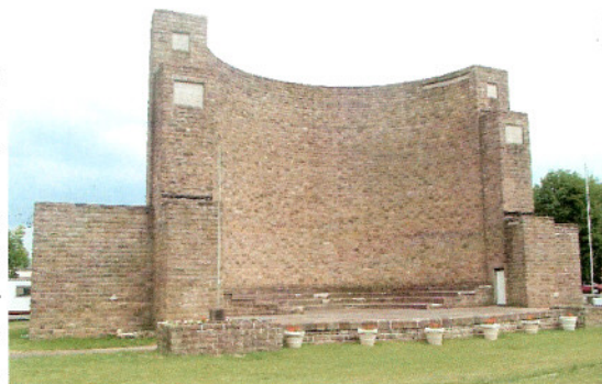
Above: Roxbury Bandshell

Recently, the Bandshell has been filled with songs, entertainment, arts, and community events such as the Bandshell Bark Dog Walk, Christmas