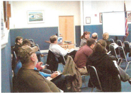
Above: Brownfield Revitalization Program Meeting held January 24, 2008

Eligible brownfield sites are abandoned, idled, or under-utilized facilities where expansion or redevelopment is complicated by real or perceived environmental contamination. Reuse of local derelict brownfields through the JRA's Brownfield Revitalization Program is a "Smart Growth Initiative" for Cambria County. It utilizes existing infrastructure, facilitates job growth, increases the local tax base, and protects the environment while creating a more attractive and healthier place to live & work.