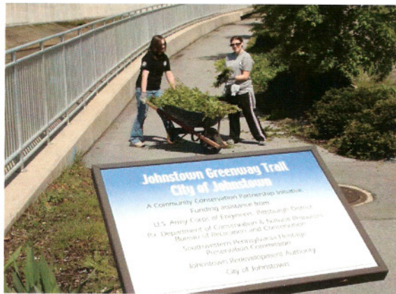
(Volunteers cleanup the Urban Greenway Trail)

Created in 1994, AmeriCorps is the national service movement engaging thousands of Americans of all ages and