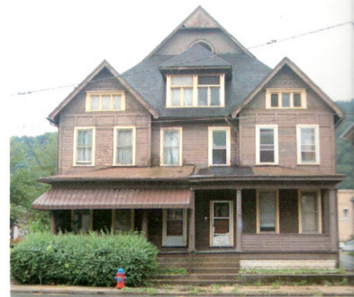
(446-448 Somerset Street)

Preliminary work plans and specifications have been designed and, following schedule, work began in June.