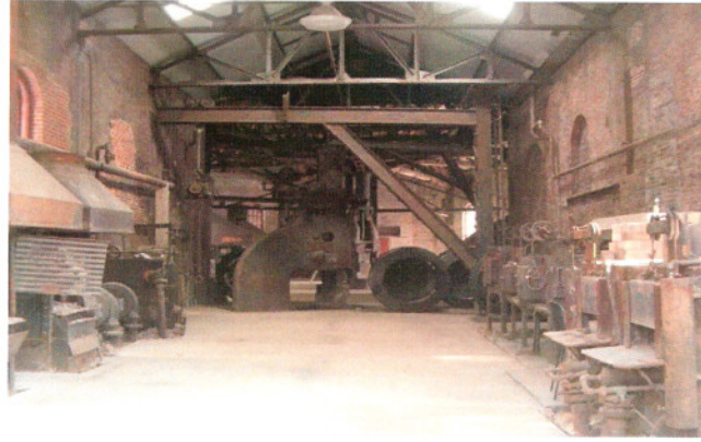
(Interior view of the Blacksmith Shop)

The funding will allow for final remediation and rehabilitation needed to return the two integral wings of the Blacksmith Shop to productive use.