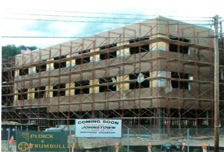
(Construction continues on the Greater Johnstown High Tech Park)

Located between Franklin and Napoleon Streets, the Riverwalk will provide critical linkage to other area trails