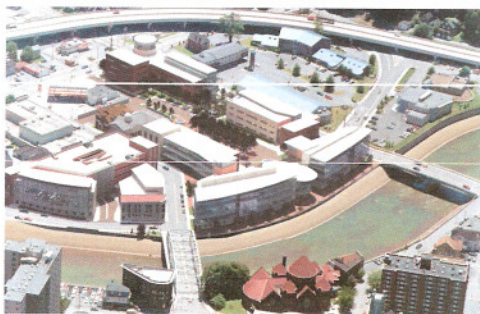
(Rendering of the High Tech Park)

For More Information, Visit www.johnstowntechpark.com