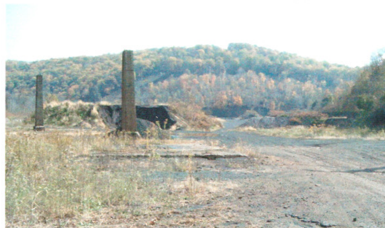
(Rosedale/Ore Yard brownfield adjacent to the Cambria Iron Works)

Previous EPA Assessment and Cleanup funds were critical in the redevelopment of the Cambria Iron Complex, which is now home to five light industrial manufacturing businesses. The Authority is looking to build upon these successes