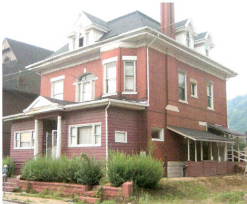
(444 Somerset Street)

and brownfield redevelopment are vital components of the City’s Recovery Plan and Cambria County’s Master Plan for environmental remediation and economic development opportunities.