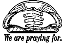
We are praying for...

Mon 2/18: Leviticus 19:1-2, 11-18/Matthew 25:31-46 Tue 2/19: Isaiah 55:10-11/Matthew 6:7-15 Wed 2/20: Jonah 3:1-10/Luke 11:29-32 Thurs 2/21: Esther C:12, 14-16, 23-25/Matthew 7:7-12 Fri 2/22: 1 Peter 5:1-4/Matthew 16:13-19 Sat 2/23: Deuteronomy 26:16-19/Matthew 5:43-48 Sun 2/24: Genesis 15:5-12, 17-18/Philippians 3:17—4:1/Luke 9:18b-36 + + + + +