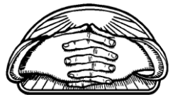
We are praying for...

All the men and women fighting for our country in the military services, all the elderly, homebound, sick