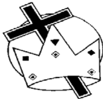
Righteous Peace, Godly Glory.

Wherever the Good News of Jesus was preached, it met the same opposition as Jesus did, and many of those who began to follow him shared his suffering and death. But no human force could stop the power of the Spirit unleashed upon the world. As we observe the Feast of the First Martyrs of the Holy Roman Church on June 30 we find that one common feature in the stories of many martyrs is that they are accused and condemned without a fair trial. From the time of the earliest martyrs to 20th-century martyrs, they usually find themselves accused and condemned in the same breath. People of faith are most often killed not because of their great faith, but because of great fear in those of little faith. Honor those who have the courage of their convictions.