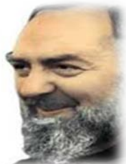
- Saint Padre Pio

"Pray, hope, and don't worry. Worry is useless. God is merciful and will hear your prayer."