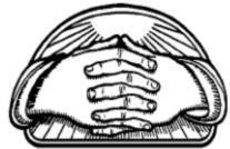
We are praying for...

Mon 8/17: Jgs 2:11-19/ Mt 19:16-22 Tue 8/18: Jgs 6:11-24a/ Mt 19:23-30 Wed 8/19: Jgs 9:6-15/ Mt 20:1-16 Thu 8/20: Jgs 11:29-39a/ Mt 22:1-14 Fri 8/21: Ru 1:1, 3-6, 14b-16, 22/ Mt 22:34-40 Sat 8/22: Ru 2:1-3,8-11; 4:13-17/ Mt 23:1-12 Sun 8/23: Jos 24:1-2a, 15-17, 18b/ Eph 5:21-32/ Jn 6:60-69