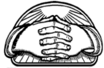
We are praying for...

Mon 9/14: Nm 21:4b-9 / Phil 2:6-11/ Jn 3:13-17 Tue 9/15: 1 Tm 3:1-13/ Jn 19:25-27 Wed 9/16: 1 Tm 3:14-16/ Lk 7:31-35 Thu 9/17: 1 Tm 4:12-16/ Lk 7:36-50 Fri 9/18: 1 Tm 6:2c-12/ Lk 8:1-3 Sat 9/19: 1 Tm 6:13-16/ Lk 8:4-15 Sun 9/20: Wis 2:12, 17-20/ Jas 3:16—4:3/ Mk 9:30-37